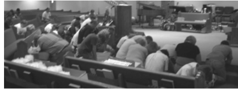
Crossover TTU participants pray before going out to visit.

About 30 members of First Baptist joined with seven other churches in reaching out to students around and on campus. Experiences varied greatly among those who went out. Though many encountered doors where no one answered, others were able to share the gospel and receive prayer requests.