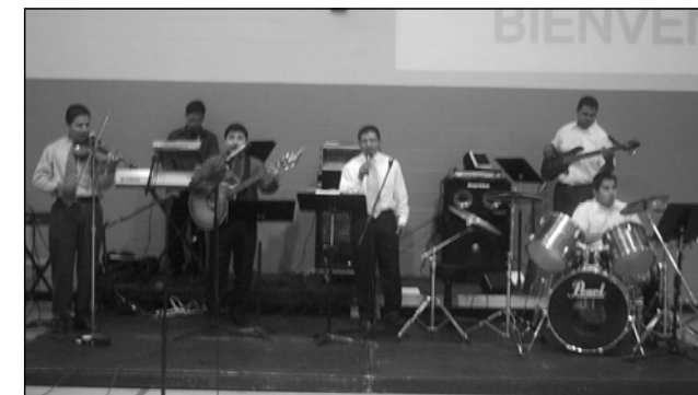
The band that played for Rio Vivo's third anniversary.

Rio Vivo celebrated its third anniversary with a special service on Sunday, October 15. A 10-member band led the Hispanic church in worship as 70 people attended the service. Two ladies made professions of faith during the service.