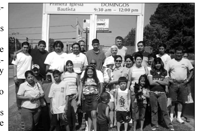
Some of the members of Rio Vivo.