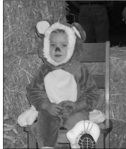
Some of the many happy costumes (above and left) at the Harvest Festival.