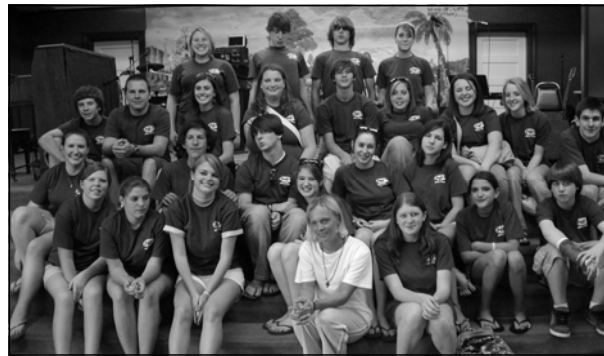
The Chi Rho Youth Choir performed at Wings of Life Rehab Center in Mobile as part of their Summer Tour to the Gulf Coast last year.

Beginning June 2, this week long tour will take the choir to Winter Park, Florida for the annual Baptist Church Music Conference. Chi Rho has been invited to sing as the demonstration choir for this national conference of Baptist church musicians and educators. In addition to attending the conference, Chi Rho will be performing at local churches and ministry centers.