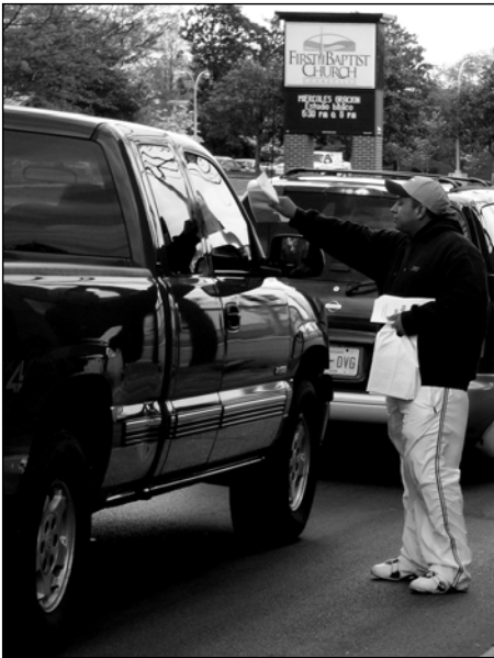
A member of the Hispanic team (above) from Río Vivo hands a passenger a packet on Saturday, April 7.

In the spirit of Easter, a Hispanic team from Río Vivo Primera Iglesia Bautista took over the streets of East Spring and Walnut Avenue on Saturday, April 7. On a very cold, windy day, we shared the good news that "Easter is Jesus."