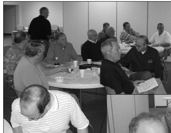
The Deacons prepared a pancake breakfast (above) on Easter Sunday morning.