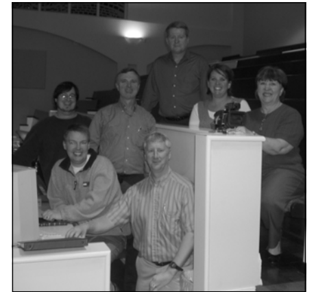
Members of the Media Ministry crew

First Baptist is blessed to have such a wonderful means of outreach. The media ministry is a sterling example of dedicated men and women using their unique talents to serve the Kingdom with today's technology.