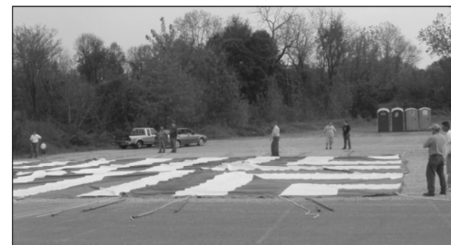
Several volunteers put up the tent on Friday, May 4.