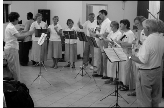
A team of adult ringers carried choirchimes to Dominica for their music mission trip in March.

As the handbell and choir chime season comes to a close, three of these ensembles will be playing in worship today. In addition to the youth bell team, which performed in the early service last Sunday, the bell choirs that will be ringing today include the Praise Ringers, the Alpha Bells, and the Children's ChoirChimes.