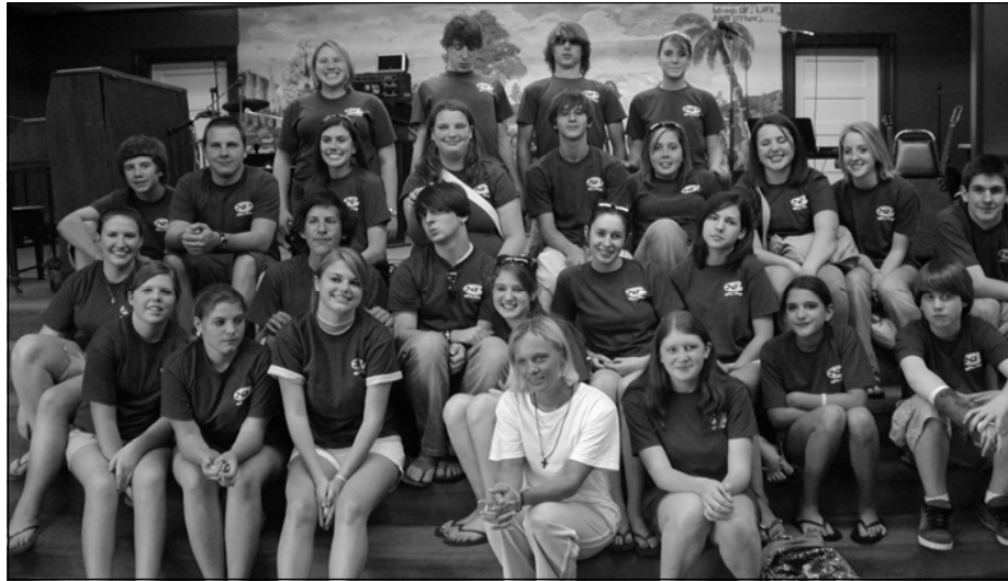
The Chi Rho Youth Choir ministered at a drug rehabilitation center during the 2006 Tour to the Gulf Coast.

tour of the NASA facility, the choir will visit Cocoa Beach.