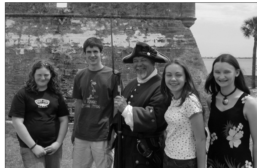
Youth singers learn some history in St. Augustine, Florida.