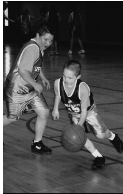
Upward gives you the opportunity to not only teach basketball and cheerleading skills but also to help build a child's self-esteem and character.

Sign up for Upward Basketball and Cheerleading in the church office. For more information, call the church office at 526-7108.