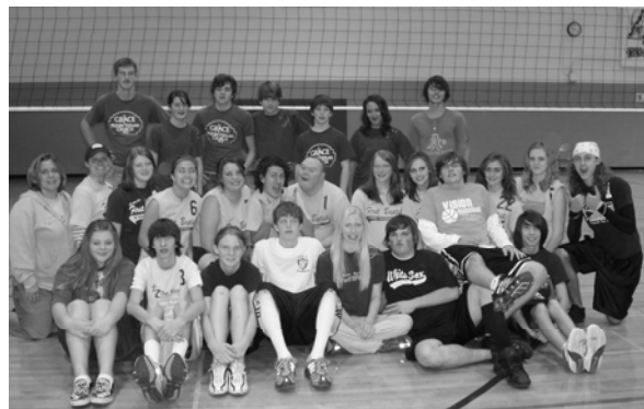
The First Baptist Youth volleyball team (above middle) and the First Baptist Blue team (below front) captured their respective division tournament titles recently.

It has been a championship season for First Baptist Church's volleyball teams. The First Baptist Blue team won the BB division tournament on November 6 while the First Baptist Youth took home their tournament championship on November 29.