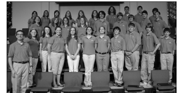
The Chi Rho Youth Choir has experienced great growth in 2007. Last year the choir had 40 people on the roll and averaged 31 at rehearsal. This year the number enrolled has increased to 48 with an average attendance of 38 and a high attendance of 49.