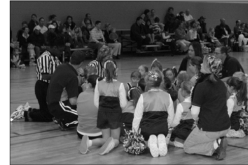
Eight decisions were made for Christ during the 2006-2007 Upward season. The 2007-2008 season has seen an increase in registration with 342 basketball players and cheerleaders signed up compared to 319 last year.