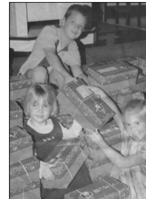
First Baptist Church members brought in 552 boxes for Operation Christmas Child and FBC collected a total of 10,177 boxes from the Upper Cumberland.