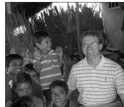
Members of First Baptist were active in missions during 2007. Missionaries from First Baptist went to Bay St. Louis, Chalmette, Louisiana, Townsend, Centrifuge/M-Fuge, Dominica, Barbados, India, Brazil, Africa, and Romania. FBC also hosted a Tent Revival in the parking lot across the street. More than 230,000 decisions were made during these trips.