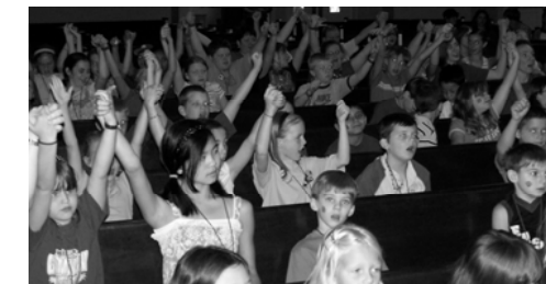
Fifteen decisions were made for Christ during Vacation Bible School in June.