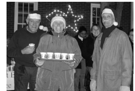
The 55+ Ministry Team along with youth and college students and the Young Adult Sunday School class handed out 800 cups of hot chocolate and postcards from the church at the Christmas Parade.