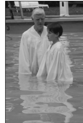
Thirty-five people were baptized at FBC this year.