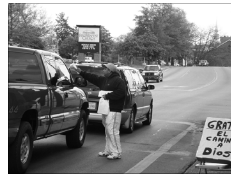
The Hispanic Ministry saw five professions of faith through the evange-street ministry in 2007. Twenty-nine professions of faith were made at the Stevens Street Care Center and 300 Hispanic families received help there this year. Rio Vivo had an average attendance of 20 and four professions of faith were made in church during 2007.