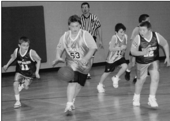
Upward games run from 8:00 a.m. to 8:00 p.m. on Saturdays. Approximately 342 children are involved in Upward Basketball and Cheerleading.

There are six more weeks of games in the Upward season and plenty of activities still to come. Sunday, February 3 will be Upward Day at First Baptist Church as basketball players, cheerleaders, coaches, parents, and siblings join the FBC family in worship during the 10:45 a.m. service. On February 28, Upward teams will go to a Tennessee Tech basketball game. Tickets are available for all Upward Basketball players, cheerleaders, volunteers and their families for $1.