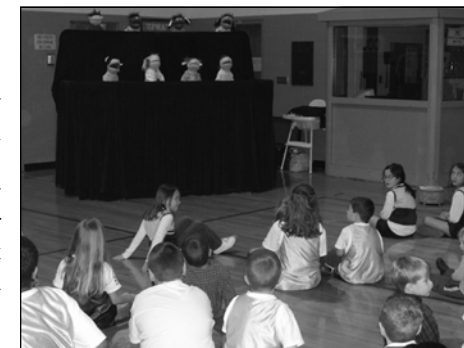
Luminesce entertained Upward players, cheerleaders, and their parents with a puppet show in the gym on Upward Day.