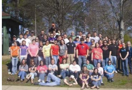
The team of 61 students and leaders from the Baptist Collegiate Ministries (above) spent Spring Break in Gulfport, Mississippi helping rebuild (below) in six different sites affected by hurricanes.