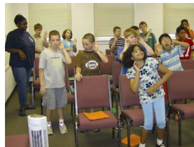
4th-6th grade choir