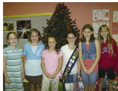
Girls in Action