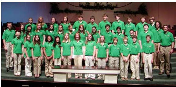
Chi Rho Youth Choir