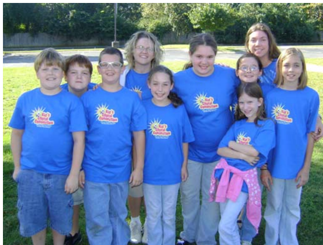
The First Baptist Young Musician group at last year's Kids Choral Connection.

Children from across Tennessee will be coming to First Baptist Cookeville this weekend for the annual Kids Choral Connection (KCC). Sponsored by the Tennessee Baptist Convention, this event brings children in 4 th -6 th