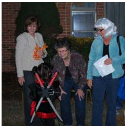
Neighborhood Harvest Festival

On Saturday, October 30 and Monday, November 1, families flooded First Baptist Church for Upward Basketball and Devoted Basketball evaluations and