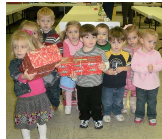
Children from Mother's Day Out bring their boxes to the volunteer team.

First Baptist, you did it! You brought in 750 shoeboxes! We are going to greater heights next year. Can you imagine all the little boys and girls that are going to receive your gifts in the next few months? How can I begin to