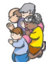
Please Pray For: