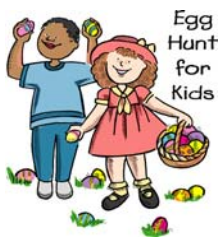
Egg Hunt for Kids

Youth will enjoy a treasure hunt from 1:00-3:00 p.m. on Saturday, April 23. This hunt starts and ends at the Fellowship Hall with stops throughout the community. Prizes will be awarded. At the end of the hunt, the Gospel will be presented. Invite a friend to enjoy fun, food and fellowship.