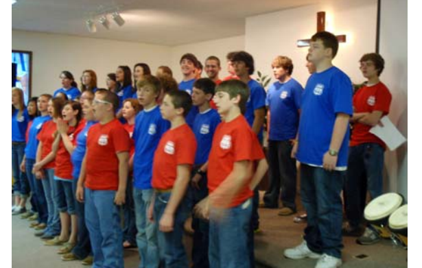
Chi Rho Youth Choir

Our youth are not only the church of tomorrow; they are very much a vital part of the church today. I am thankful